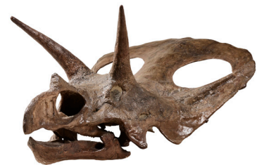
Holotype skull of Torosaurus latus , Wyoming, Niobrara County, Late Cretaceous Lance Formation (68 million years ago). Collected in 1891 by John Bell Hatcher. Yale Peabody Museum of Natural History, inv. no. YPM VP.001830.

James Prosek: Art, Artifact, Artifice is accompanied by a fully illustrated catalogue with extensive texts by the artist ( artgallery.yale.edu/publication/prosek ) and an audio tour that features the artist, scientists, educators, and curators discussing objects in the show. The audio tour is available on the Yale University Art Gallery's free mobile app ( artgallery.yale.edu/visit/app ).